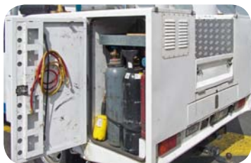
Purpose build sealed compartment