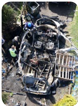
Aftermath of acetylene explosion